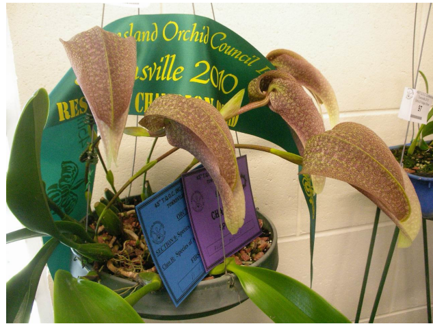
Bulbophyllum grandiflorum 'Eric' HCC/AOC (Reserve Champion)