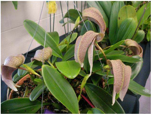
Bulbophyllum grandiflorum 'Eric' HCC/AOC (Best Specimen)