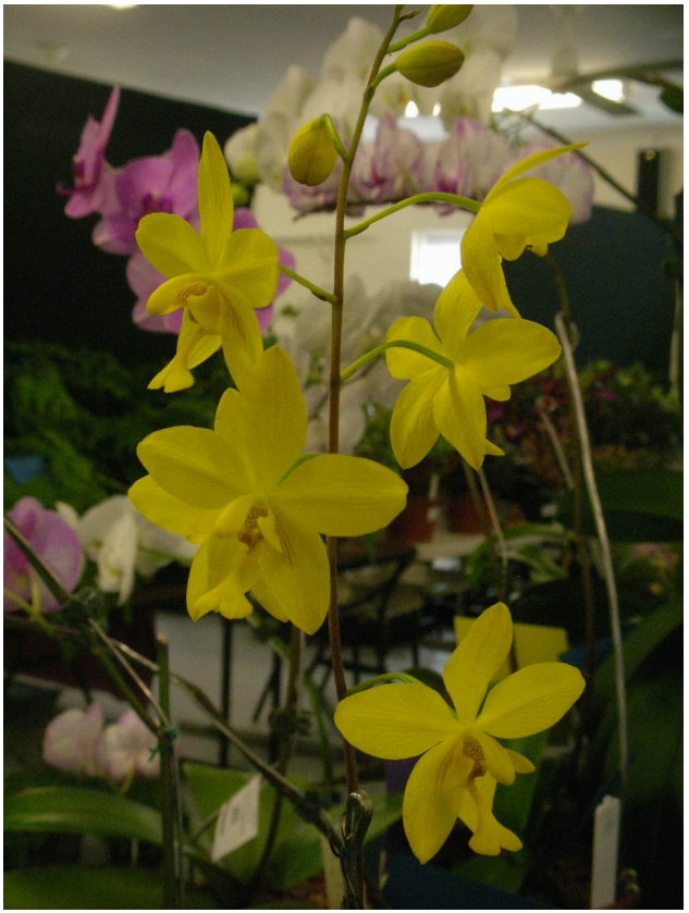
Spa. Gold Tower