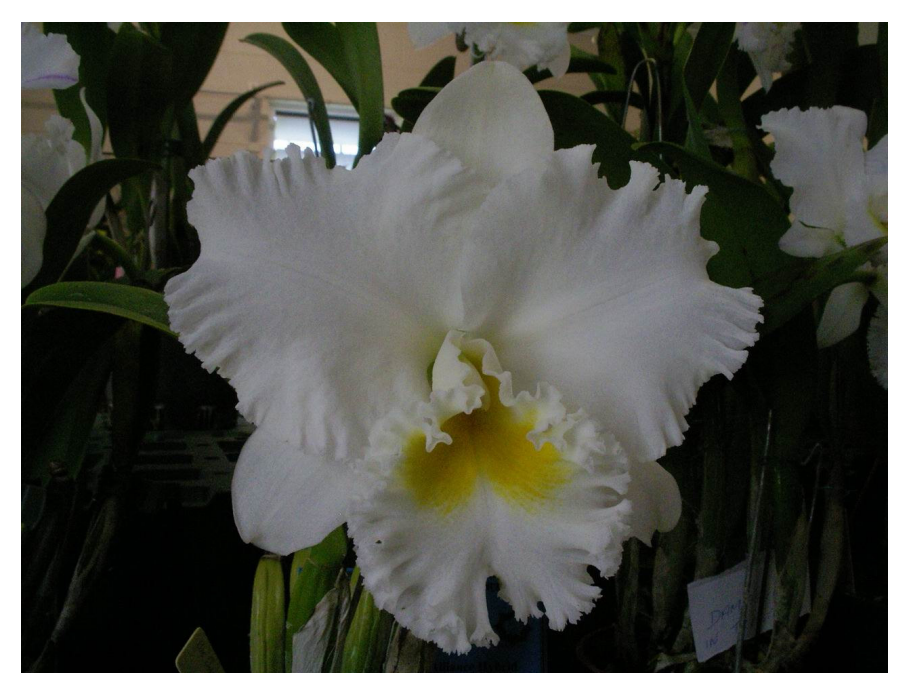
Grand Champion Orchid: Blc. Burdekin Bells 'Robert'