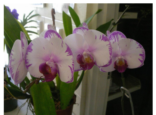
Dtps. Taisuco Firebird 'Allson'