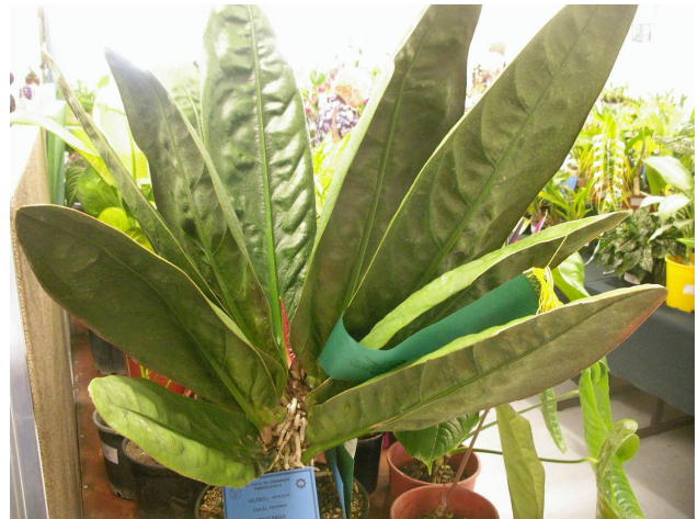
Reserve Champion - Foliage