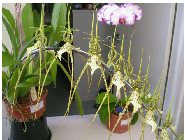
Brassia Data Cosa 'Coos Bay'