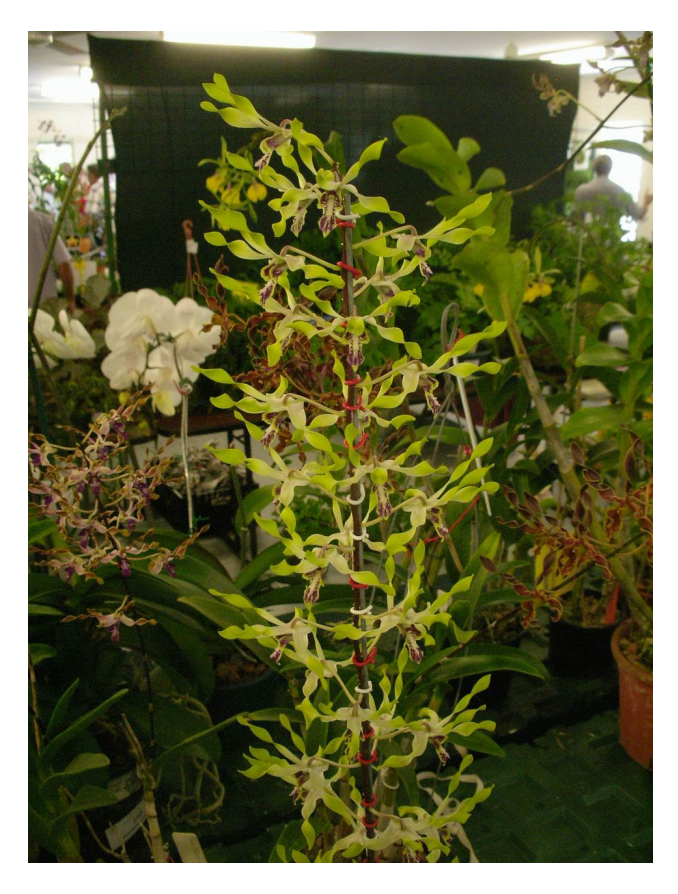
(Den. Anching Lubag x Den cochloides) x Den. canaliculatum