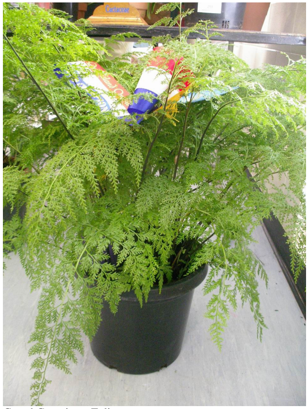
Grand Campion - Foliage