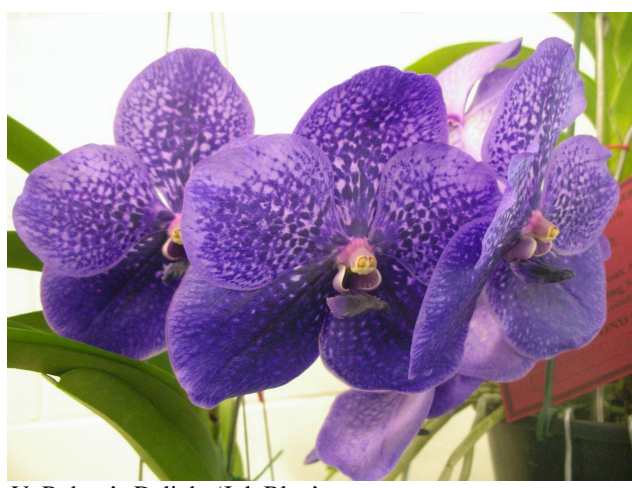
V. Robert's Delight 'Ink Blue'